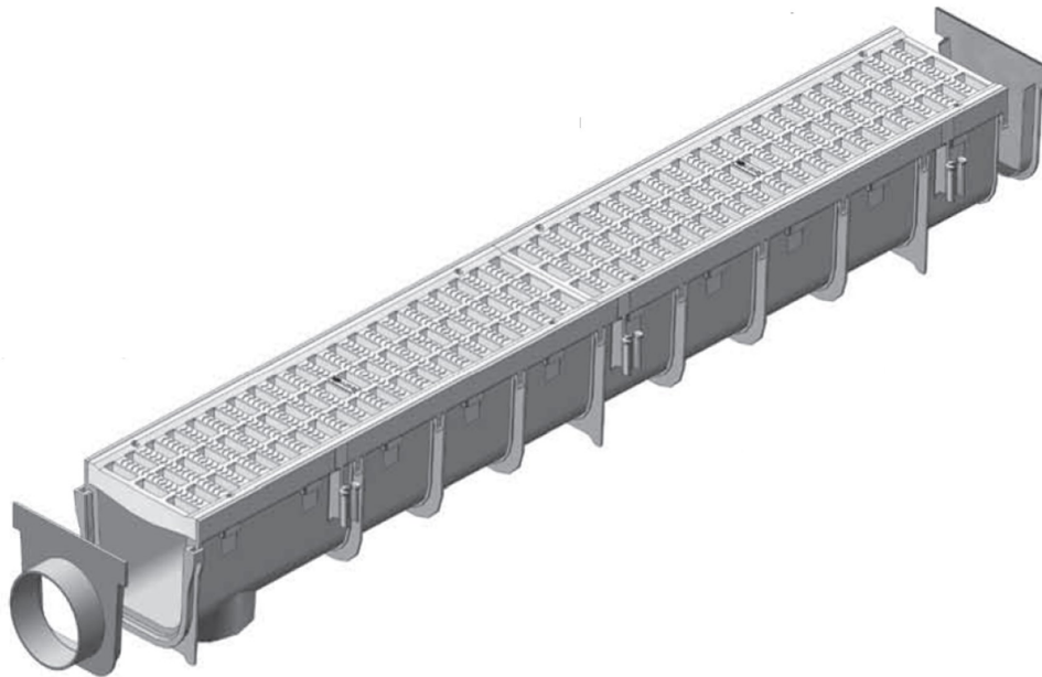
NDS #864 Polypropylene